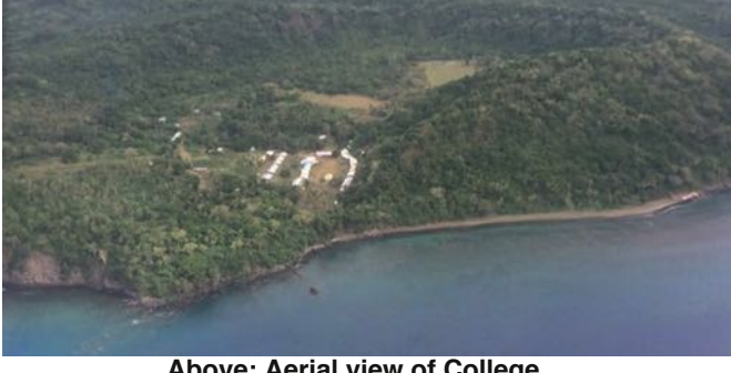
Above: Aerial view of College Right: Map of Vanuatu showing location of Ambae