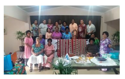
Some of the Suva-Ovalau AAW members who attended the workshop showing the completed stoles