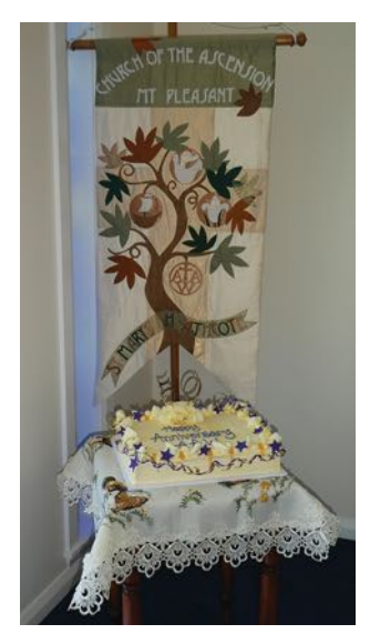
Above: The Golden Jubilee Cake in front of the AAW banner of the Church of the Ascension, Mt Pleasant, Christchurch and Right: Close-up of the special cake