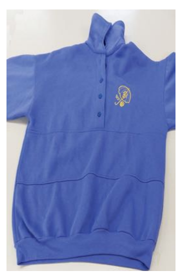
An AAW sweatshirt showing our original AAW Umbrella logo.